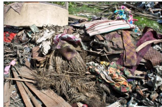
Finished products & raw materials, totally damaged