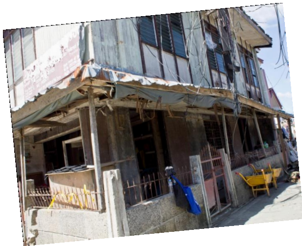
Showroom cum factory building – partially damaged

Total Damages & Losses: US$66,000 (PhPP2,892,000)