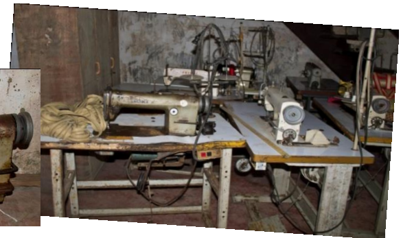
Nine (9) units high speed sewing machine, all damaged by sea-water