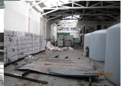
Coconut Wine Producer Tacloban City