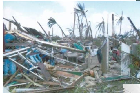
Shell Craft Maker Guiuan, Eastern Samar