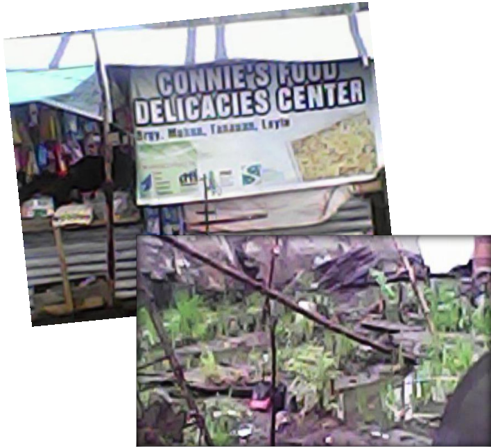
Banana Chips Processor Tanauan, Leyte