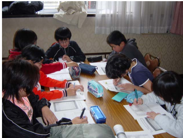
Making Business Plan