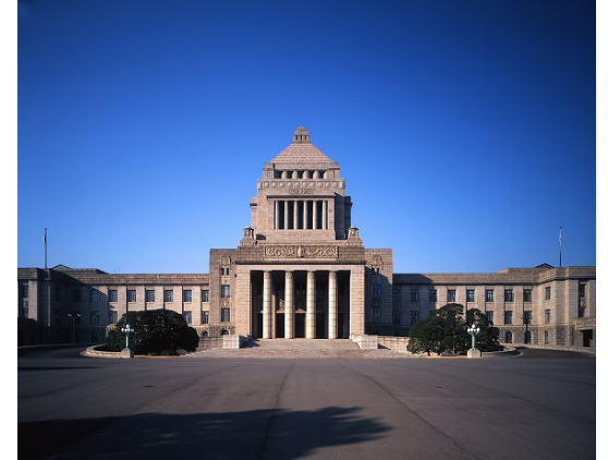
(Japan's National Diet Building)

To set a goal to make the number of candidates of both genders as even as possible in the national and local elections.