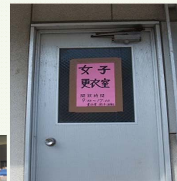
<women's changing room>