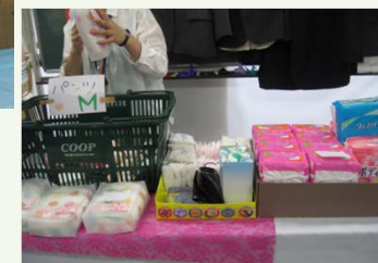
<providing sanitary products>