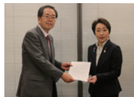
Encouragement to political parties to increase the proportion of women candidates by the Minister (right side)

In addition, the government has been providing information, including a map it created that vividly shows the situation of women's participation in politics.