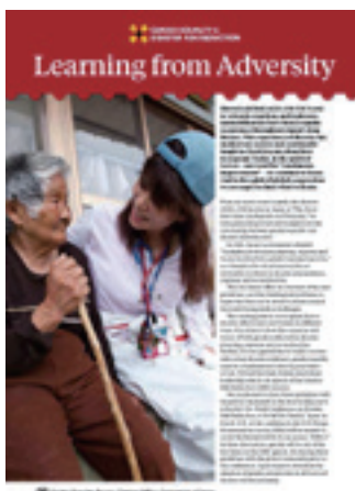
English-language pamphlet’s cover