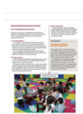
Efforts deemed necessary at each phase