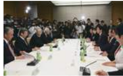
The Prime Minister's request to the business community (Cited from the Prime Minister's Cabinet website.)