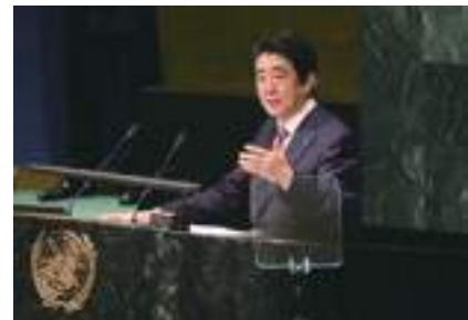
The Prime Minister's speech during the UN General Assembly's General Debate (2015)