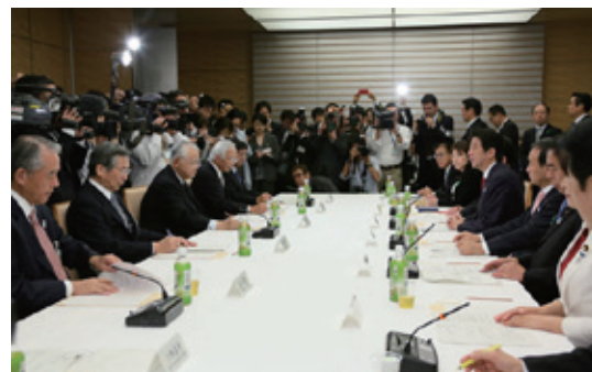
The Prime Minister's request to the business community (Cited from the Prime Minister's Cabinet website.)

If women are involved in corporate decision-making, diverse values will be reflected in the management of the company. At organizations receptive to diverse values, innovation will be promoted and the company's competitiveness and evaluation by society will improve. The company's value will also rise. Therefore, since its inauguration, the second Abe Cabinet has undertaken a number of efforts, including the Prime Minister's request to the business community in April 2013 to begin by appointing at least one woman to board position at all listed companies. In the Fourth Basic Plan for Gender Equality established in December 2015, the government set a new target to increase the proportion of women in board positions at listed companies to 5% as quickly as possible and to 10% by 2020, and the government is engaged in further efforts. As a result, the number of women board members at listed companies has steadily risen about 2.7 times in six years between 2012 and 2018. In addition, in capital markets, there is a growing movement to recognize companies promoting women's active participation, including the appointment of women directors, in ESG investment ratings, etc.