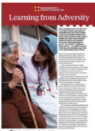
English-language pamphlet’s cover