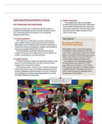
Efforts deemed necessary at each phase