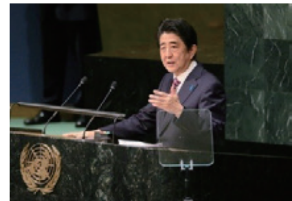
The Prime Minister's speech during the UN General Assembly's General Debate (2015)