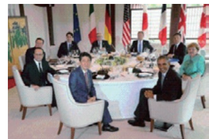
G7 Ise-Shima Summit