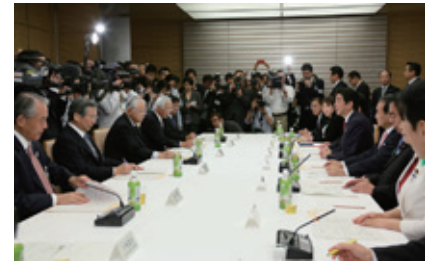
The Prime Minister's request to the business community (Cited from the Prime Minister's Cabinet website.)