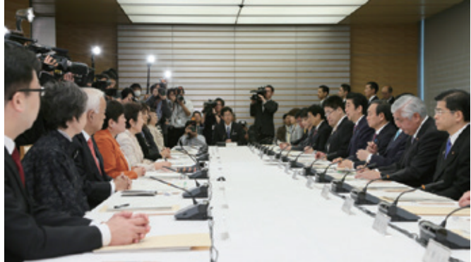
The 47 th Council for Gender Equality