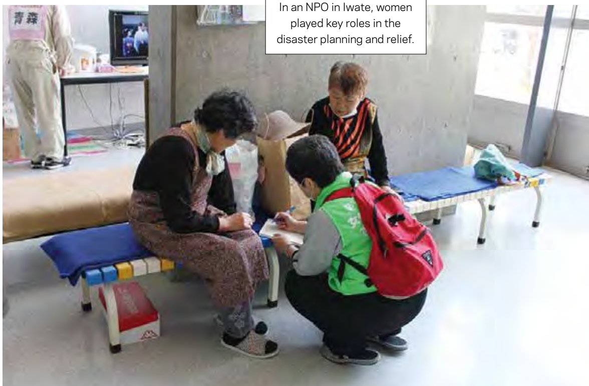
In an NPO in Iwate, women played key roles in the disaster planning and relief.

*Japan's 350 Gender Equality Centers, which are organized by local authorities, provide counseling, training programs and data related to gender equality issues and other services. They are also venues for voluntary activities by women's groups.