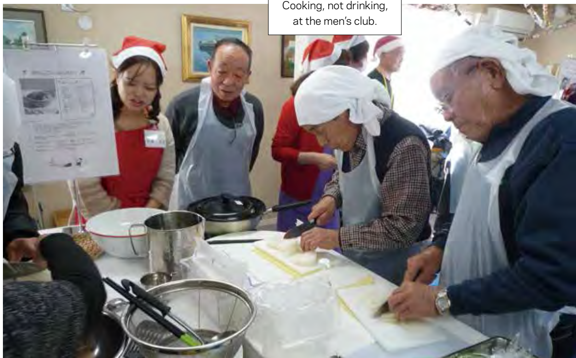
Cooking, not drinking, at the men's club.

A total of eight sessions were held with the number of participants growing throughout the program, which was supported by local government, the nursing association and visiting support workers. Support workers from outside led the planning, but the actual operation grew to include staff (for promoting healthy dietary habits) and volunteers from among the residents.