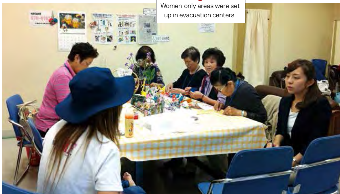
Women-only areas were set up in evacuation centers.

By creating safe and orderly space amid chaos this initiative allowed volunteers to provide effective assistance to women in the massive shelter.