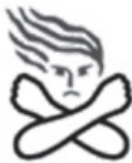
Symbol mark for Eliminating Violence against Women