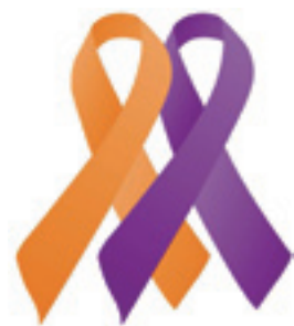
'W Ribbon' (Purple and Orange Ribbon)