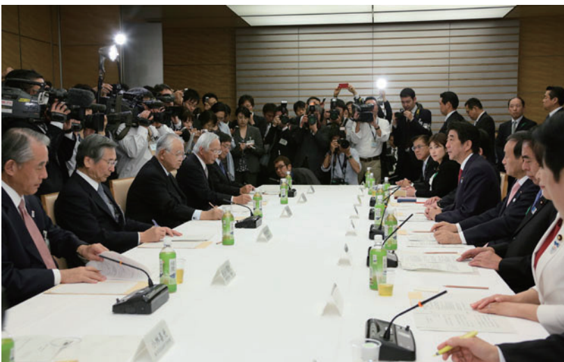
The Prime Minister's request to the business community (Cited from the Prime Minister of Japan and His Cabinet website.)

Nonetheless, the ratio of women executives at listed companies still stands at 3.7% (as of end of July 2017). In the Fourth Basic Plan for Gender Equality established in December 2015, the government set a new target to increase the proportion of women in executive positions at listed companies to 5% as quickly as possible and to 10% by 2020, and the government is engaged in further efforts.