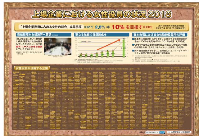
Bulletin board on situation of women executives

* Compiled based on the situation of the appointment of women executives (director, auditor, and executive officer) as of the end of July 2017.