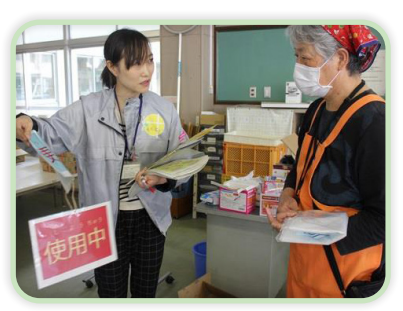
Handed out changing and nursing room signs and proposed hanging the signs on the doors of changing and nursing rooms.

early phase of the disaster, it was still difficult for the caravan team to talk with shelter managers because most of the shelters were in the midst of confusion. In such cases, the team members obtained the consent of the managers and checked the living environments in shelters on their own with the checklist. For shelters without changing rooms, they proposed installing changing rooms by bringing changing room signs. They also proposed to provide free access to sanitary goods in women's toilets.