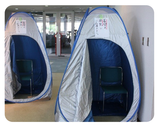
Changing/nursing room (dome tents) (Kumamoto City)