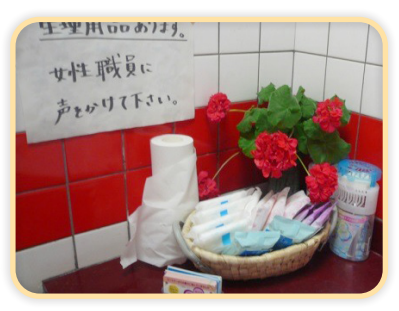
Proposed placing samples of sanitary goods.