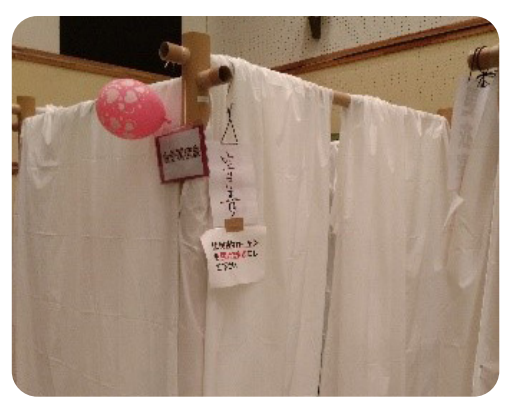
Changing room for women (using cardboard curtains) (Asakura City)