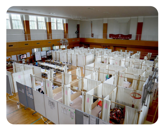
Paper partitions (Photo courtesy of Shigeru Ban Architects)