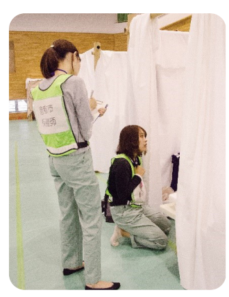
City officials (public health nurses) asking evacuees about their needs