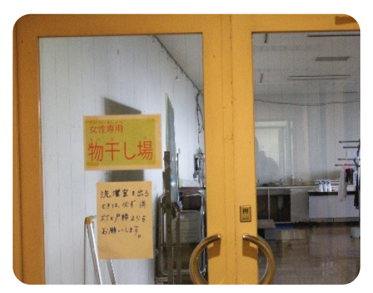
Clothes-drying space for women (Kumamoto City)