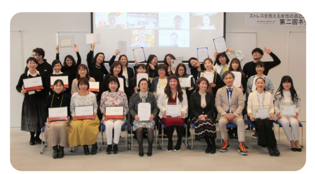
Human resource development program to improve self-recovery for women under stress

Train mental care specialists for women in coaching, mental health, and resilience by providing human resource development programs to improve self-recovery for women under considerable stress from the disaster in cooperation with private companies